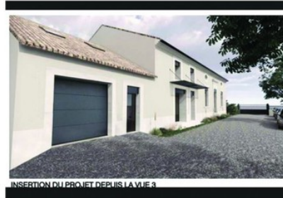
INSERTION DU PROJET DEPUIS LA VUE 3