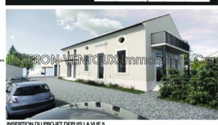
INSERTION DU PROJET DEPUIS LA VUE 5

LUBERON VENTOUX Immobilier - LUBERON VENTOUX Immobilier - Caromb