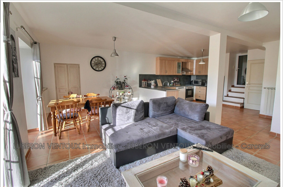
House 4699 Caromb